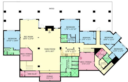
24314 Meadow Drive - Main Residence BASEMENT: 4856.94 SqFt ©2023 AIAA DESIGN GROUP, INC. ALL RIGHTS RESERVED.