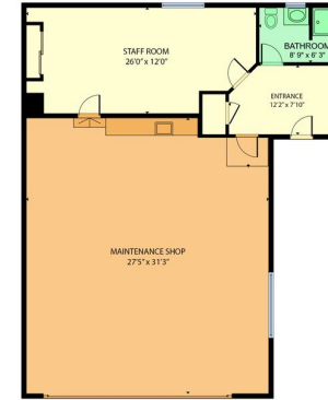
24314 Meadow Drive - Workshop WORKSHOP: 1443.5 SqFt ©2023 AIAA DESIGN GROUP, INC. ALL RIGHTS RESERVED.