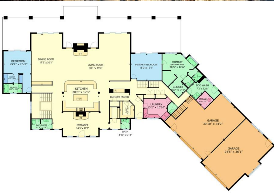
24314 Meadow Drive - Main Residence MAIN LEVEL: 4874.62 Sqft DESIGN AND CONSTRUCTION ARE APPROXIMATE. NOT TO SCALE.