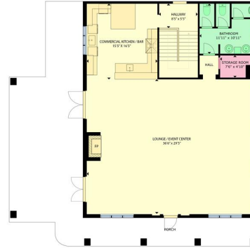
24314 Meadow Drive - Clubhouse MAIN LEVEL: 1702 SqFt ©2023 AIAA DESIGN GROUP, INC. ALL RIGHTS RESERVED.