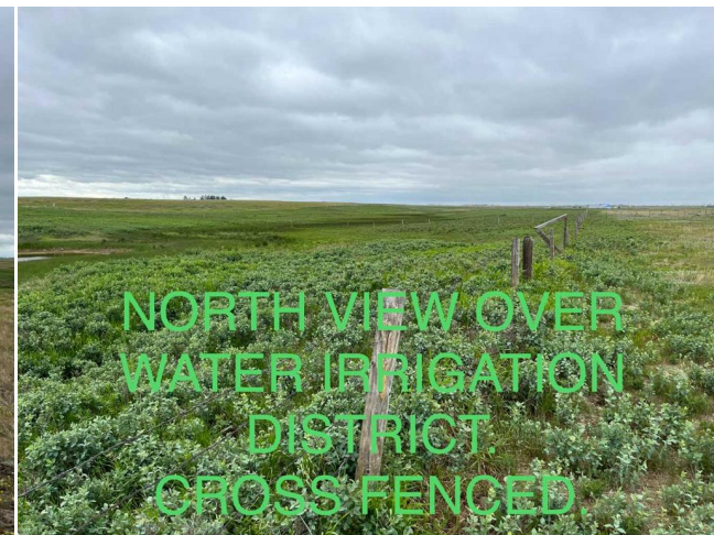
NORTH VIEW OVER WATER IRRIGATION DISTRICT. CROSS FENCED.