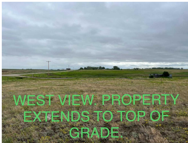
WEST VIEW. PROPERTY EXTENDS TO TOP OF GRADE.