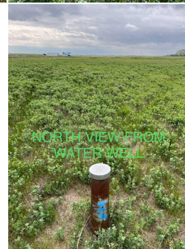
NORTH VIEW FROM WATER WELL