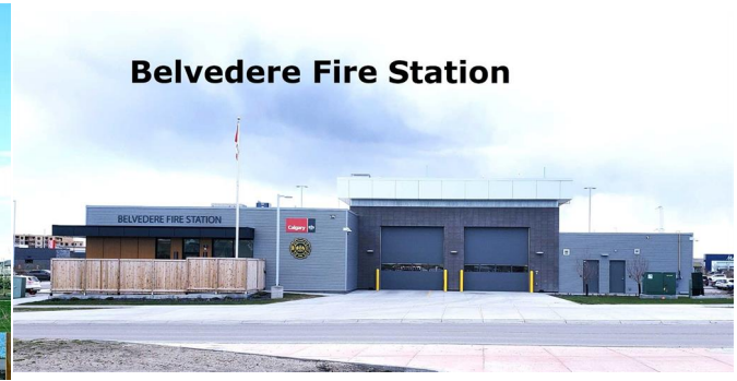
Belvedere Fire Station