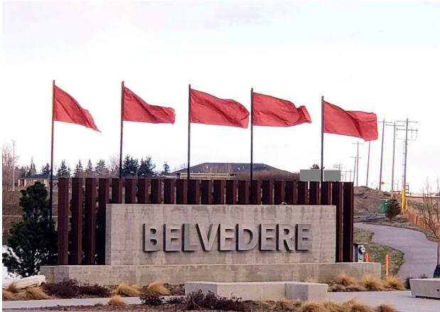
Belvedere Multi Family