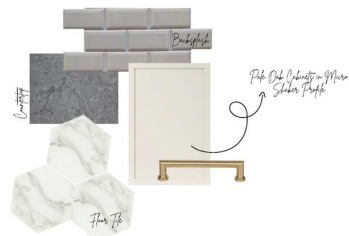
HBS-LOT 27 SPEC Laundry Room