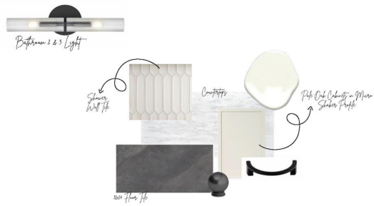
HBS-LOT 27 SPEC Bathrooms