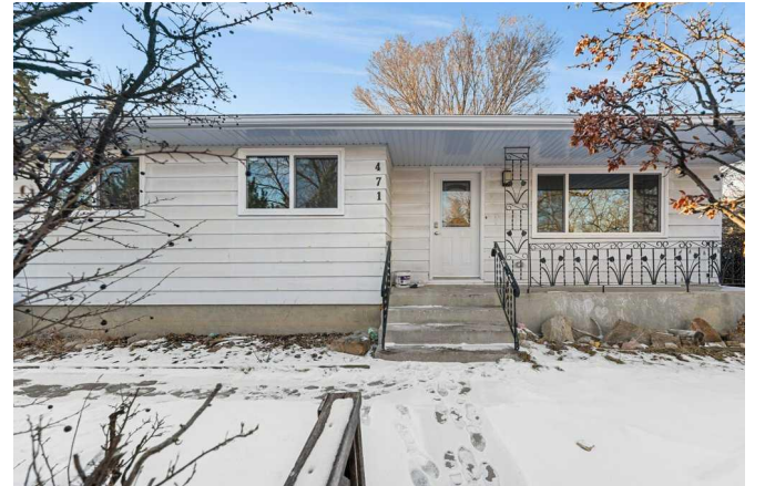
471 Northmount Dr NW, Calgary, AB