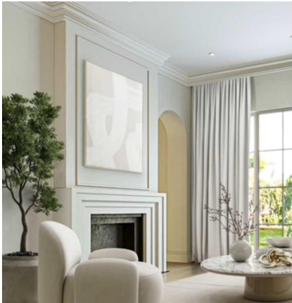
2716 5 AVE NW