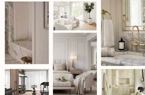
PRIMARY BED & BATH Concept Board