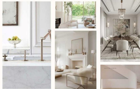
MAIN SPACE Concept Board