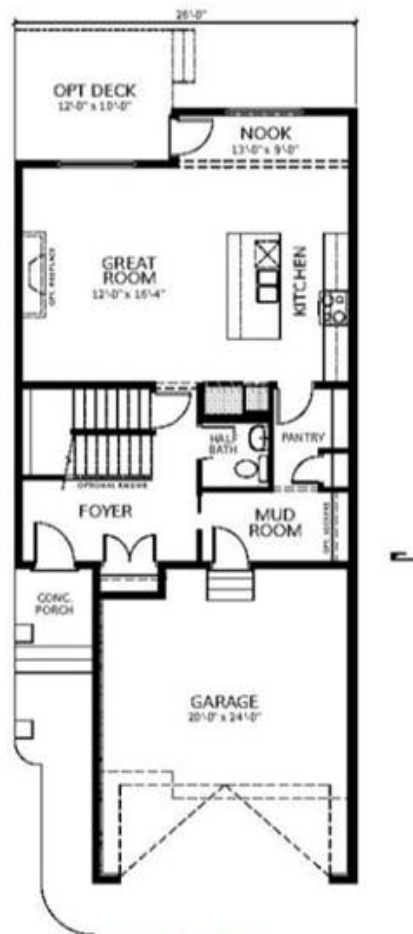
MAIN FLOOR 875 sq. ft.