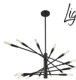
entry (open to above)