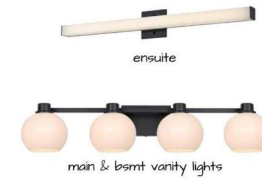
main & bsmt vanity lights