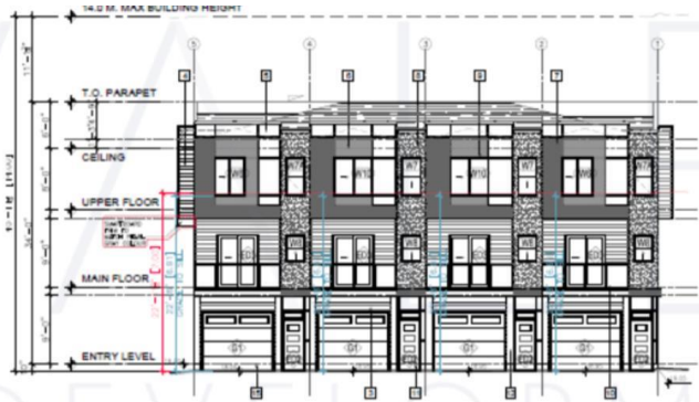
3 REAR ELEVATION - WEST (BLOCK 2) 1/8" = 1'-0" COLOR SCHEME 1