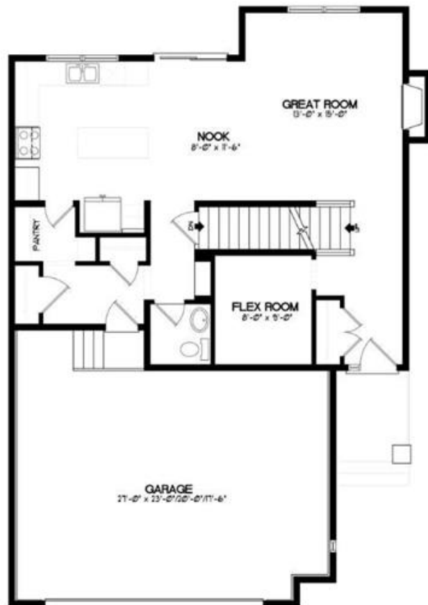
MAIN FLOOR - 875 SQFT