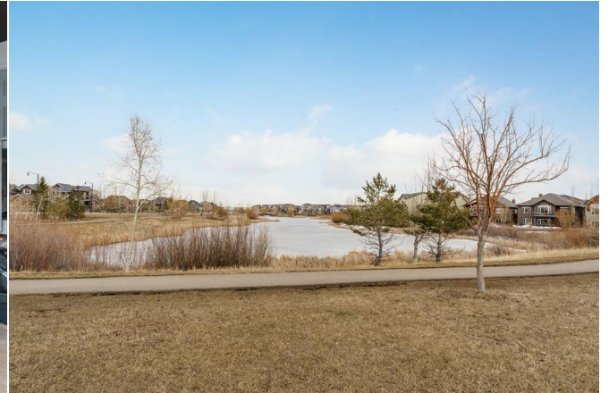
29 Cimarron Springs Rd, Okotoks, AB

Main Building Total Exterior Area Above Grade: 2841.70 sq ft