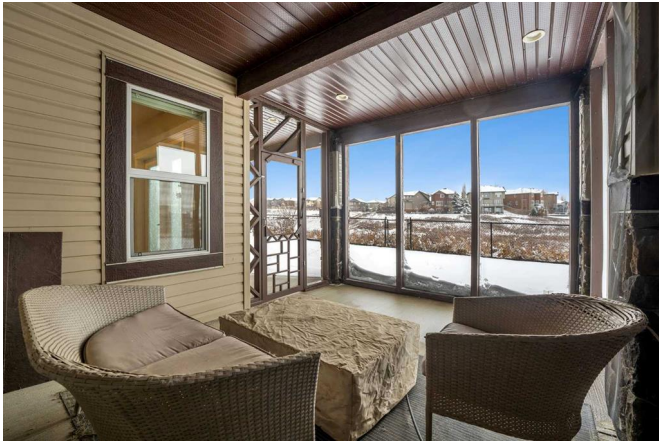
50 Sage Hill Way NW, Calgary, AB

Main Floor Exterior Area 1187.21 sq ft Interior Area 1151.86 sq ft Excluded Area 972.23 sq ft