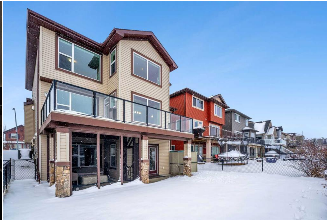
50 Sage Hill Way NW, Calgary, AB

1st Floor Exterior Area 1470.83 sq ft Interior Area 1268.80 sq ft Excluded Area 1112.16 sq ft