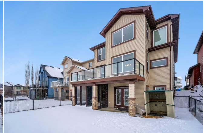
50 Sage Hill Way NW, Calgary, AB

Basement (Below Grade) Exterior Area 1111.37 sq ft Interior Area 1028.21 sq ft Excluded Area 178.31 sq ft