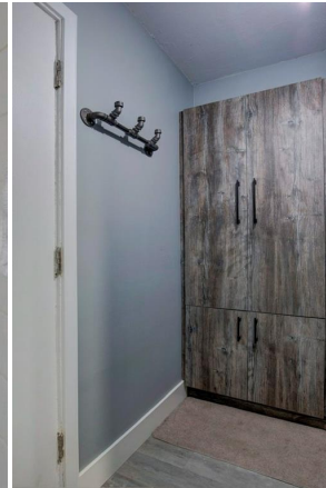
101-1027 Cameron Ave SW, Calgary, AB

Main Floor Total Interior Area 519.24 sq ft