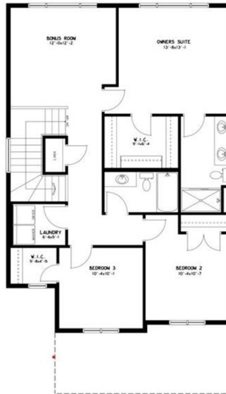
Upper Floor 1077 sqft.