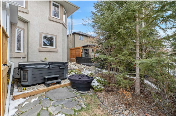
171 Sunterra Ridge Pl, Cochrane, AB

Main Floor Exterior Area 987.73 sq ft Interior Area 958.84 sq ft Excluded Area 850.31 sq ft