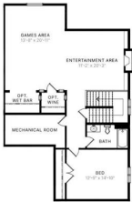
BASEMENT LEVEL 960 sq ft.