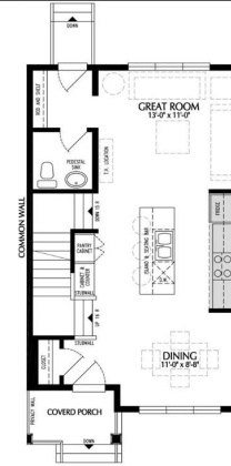
MAIN FLOOR: 624 SQ. FT.