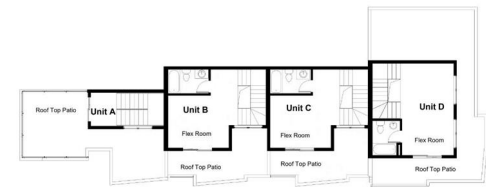
Third Floor Plan