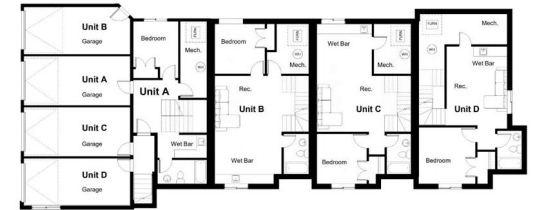
Basement Floor Plan