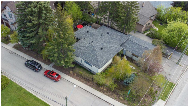
5924 Bow Crescent NW, Calgary, AB

Mark Floor Exterior Area 1595.20 sq ft Interior Area 1487.66 sq ft