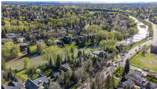
635 Sifton Blvd SW, Calgary, AB