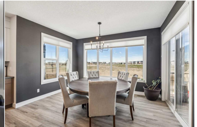
116 S Shr Vw, Chestermere, AB

2nd Floor Exterior Area 1410.17 sq ft Interior Area 1521.07 sq ft Excluded Area 256.25 sq ft