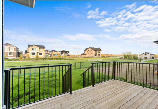
176 Sandpiper Lndg, Chestermere, AB