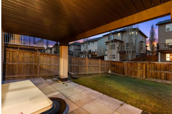
213 Hawkmere Close, Chestermere, AB

Main Floor Exterior Area 1420 sq ft Interior Area 1431 sq ft Excluded Area 449.30 sq ft