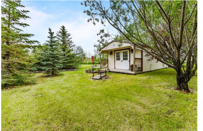
263079 Range Rd 220, Rosebud, AB

Main Floor Exterior Area 1889.44 sq ft Interior Area 1302.29 sq ft Excluded Area 624.00 sq ft