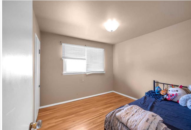
924 15 Ave NE, Calgary, AB