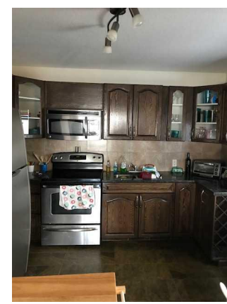
1611 36 Ave SW 6 SUITES LOCATED IN ALTADORE LOT 62 ft x 150 ft. M-R