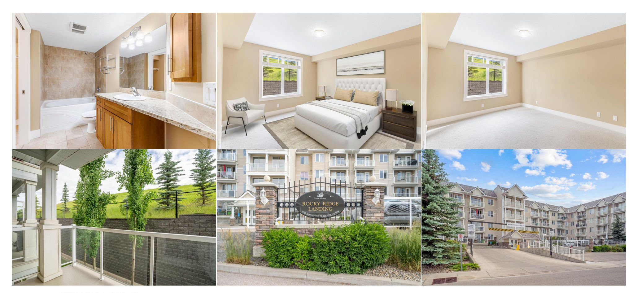
216-500 Rocky Vista Gardens NW, Calgary, AB