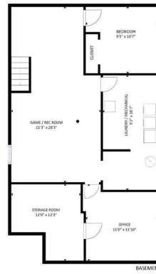
12 Big Springs Crescent - Airdrie BASEMENT: 1090.51 Sqft