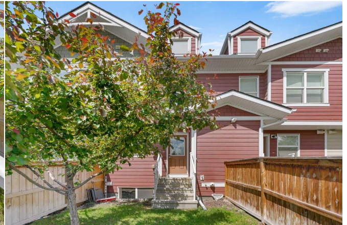
618 Cranford Mews SE, Calgary, AB