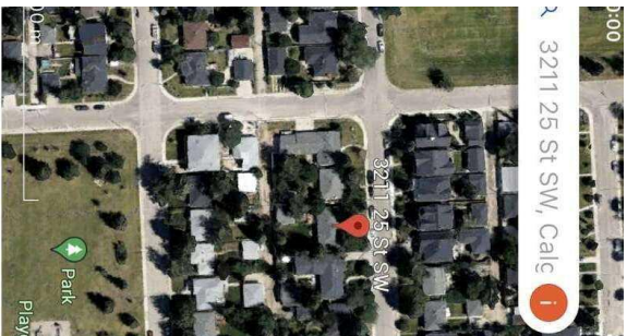
3211 25 St SW