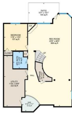
Basement (Below Grade) Exterior Area 1058.81 sq ft