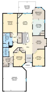
Main Floor Exterior Area 1660.07 sq ft