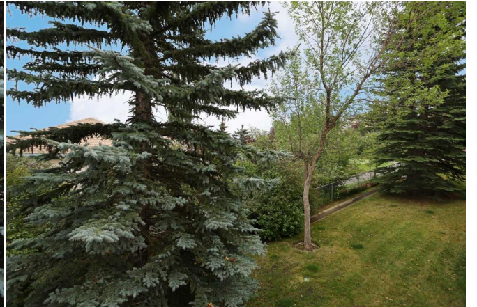
8 Hamptons Rise NW, Calgary, AB Main Building: Total Exterior Area Above Grade 1660.07 sq ft