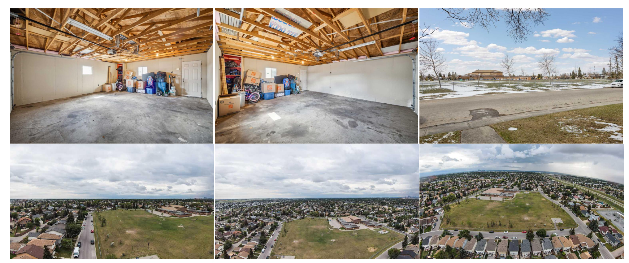
46 Templeby Way NE, Calgary, AB