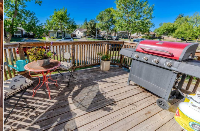
317 Banister Dr, Okotoks, AB