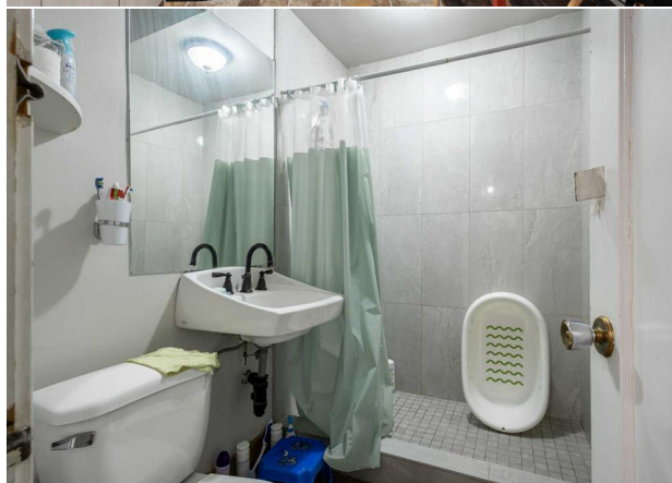
Basement (Below Grade) Exterior Area 862.31 sq ft Interior Area 801.36 sq ft