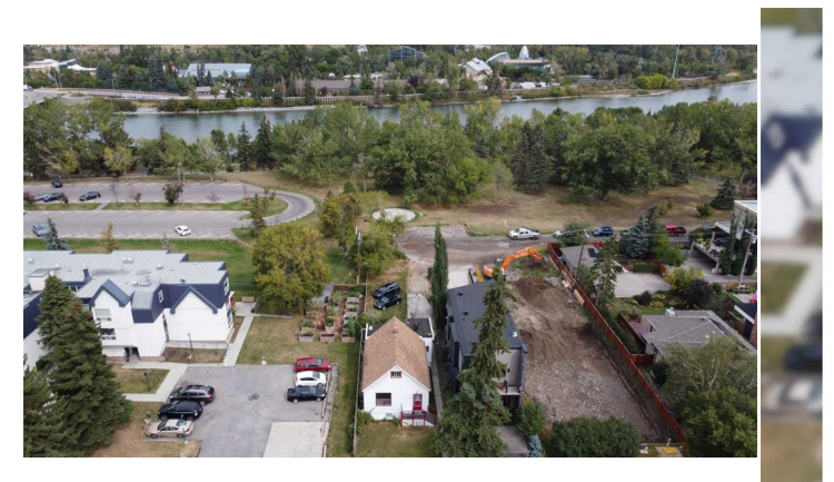
1324 8th Ave SE Approximate Boundaries