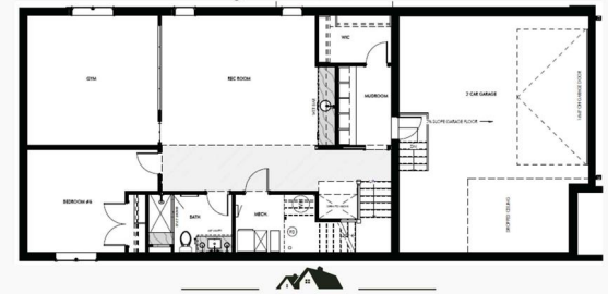
3708 8 Ave NW Basement Plan