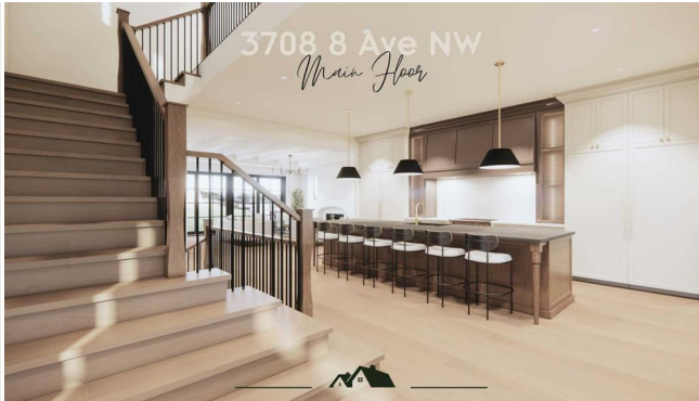
3708 8 Ave NW Main Floor