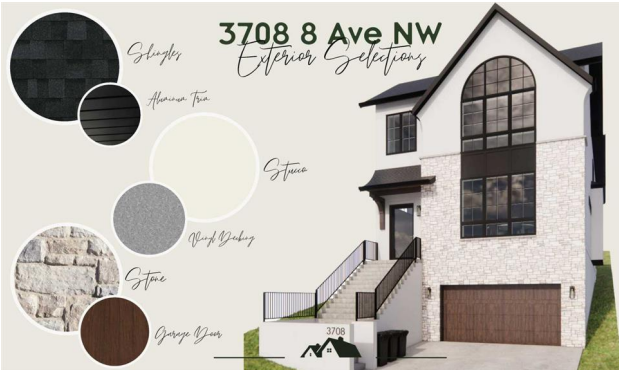
3708 8 Ave NW Exterior Selections