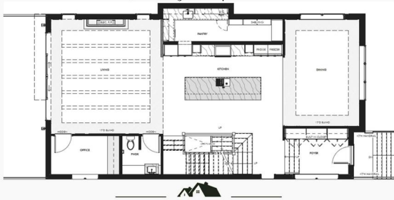
3708 8 Ave NW Main Floor Plan