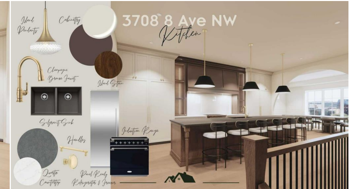
3708 8 Ave NW Kitchen