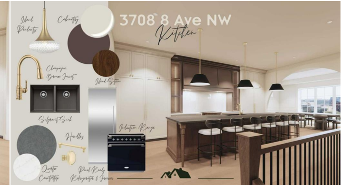
3708 8 Ave NW Kitchen