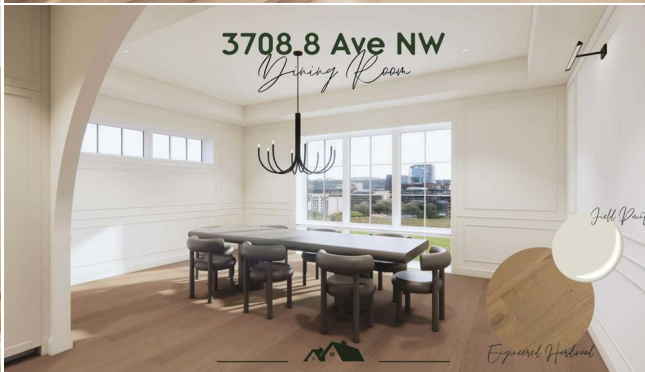
3708 8 Ave NW Dining Room