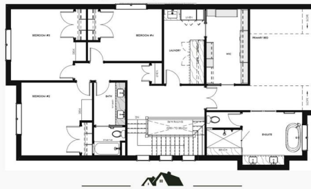
3708 8 Ave NW Second Floor Plan