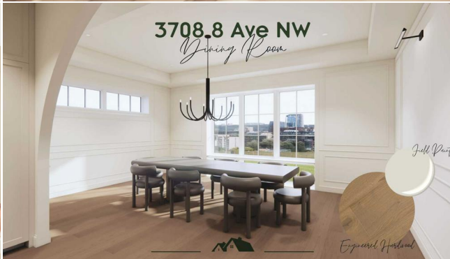
3708 8 Ave NW Dining Room