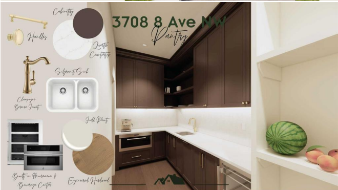
3708 8 Ave NW Pantry