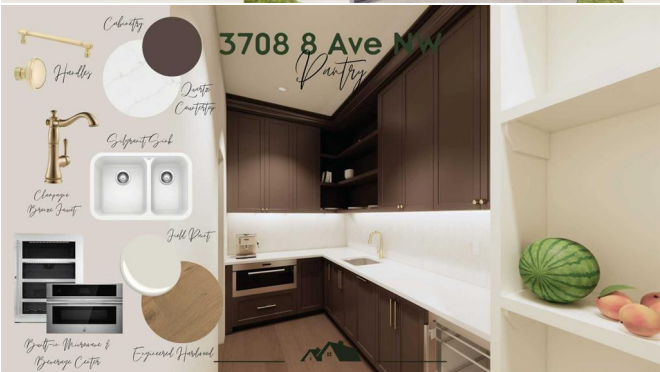
3708 8 Ave NW Pantry