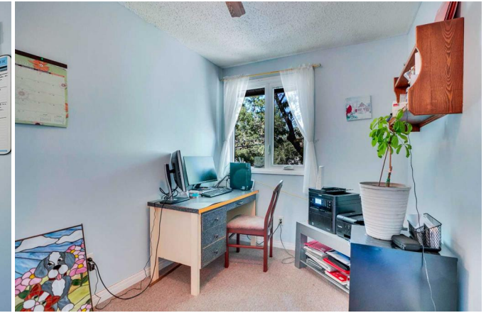
1-7524 Bowness Rd NW, Calgary, AB

Upper Floor: Exterior Area 665.49 sq ft Interior Area 607.20 sq ft