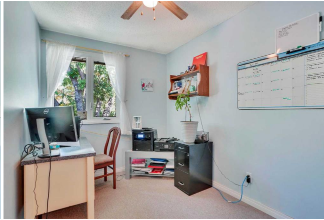
1-7524 Bowness Rd NW, Calgary, AB

Main Building: Total Exterior Area Above Grade 1277.00 sq ft