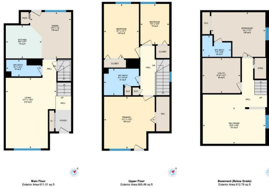
1-7524 Bowness Rd NW, Calgary, AB

Basement (Below Grade): Exterior Area 612.79 sq ft Interior Area 558.29 sq ft