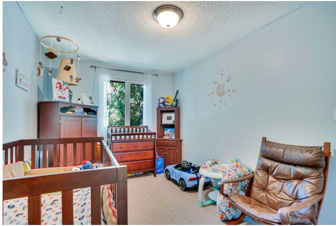
1-7524 Bowness Rd NW, Calgary, AB

Main Building: Total Exterior Area Above Grade 1277.00 sq ft