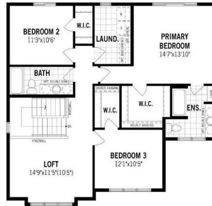
Unselected Options: Bath Oasis, Fourth Bedroom in Lieu of Loft Printed on 1/10/24

Note: Actual usable floor space may vary from the stated floor area. Plans and elevations are artist's renderings and may contain options which are not standard on all models. Mattarney Homes reserves the right to make changes to these floorplans, specifications, dimensions and elevations without prior notice and without compensation. Stated dimensions and square footages are approximate and should not be used as representation of the home's usable floor space or actual size. Any square footage of a single family home or a multi-family home that is stated herein is approximate only, may vary from time to time, and remains subject to change without notice or compensation. Revision: N/10/2024