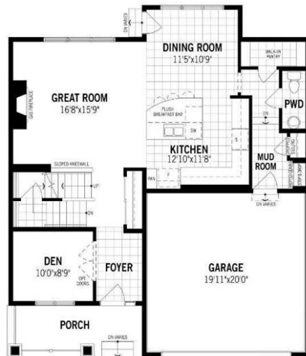
Unselected Options: Side Door Entry Printed on 1/10/24

TO VIEW THIS PROPERTY WITH AN A-TEAM BUYER'S AGENT PLEASE CONTACT (587) 700-7123