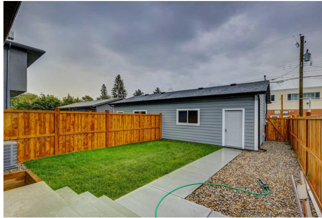
2827 Cochrane Rd NW, Calgary, AB

White regions are excluded from total floor area in GUIDE floor plans. All room dimensions and floor areas must be considered approximate and are subject to independent verification.