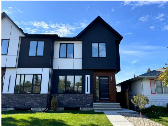
2827 Cochrane Rd NW, Calgary, AB

Main Floor Exterior Area 834.26 sq ft Interior Area 932.38 sq ft