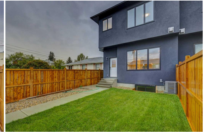
2827 Cochrane Rd NW, Calgary, AB

White regions are excluded from total floor area in GUIDE floor plans. All room dimensions and floor areas must be considered approximate and are subject to independent verification.