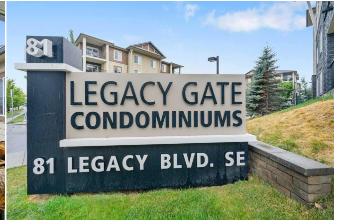
2417-81 Legacy Blvd SE, Calgary, AB