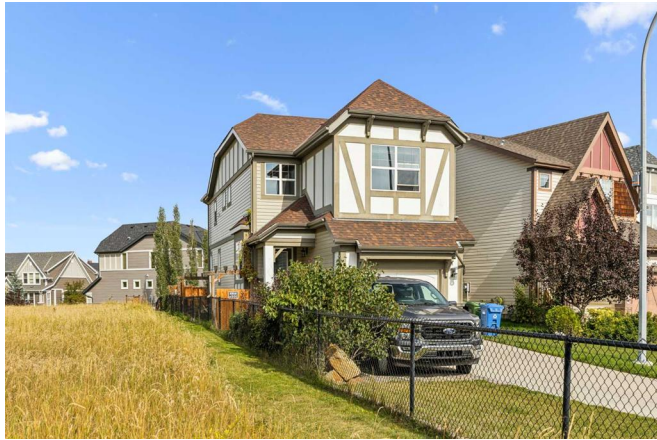
96 Chaparral Valley Common SE, Calgary, AB