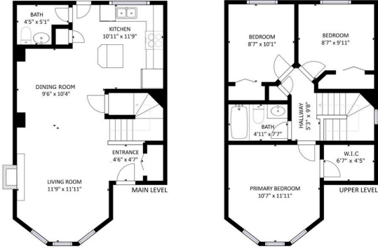
GROSS AREA 198 Cranberry Close SE - Calgary MAIN LEVEL: 570 SqFt, UPPER LEVEL: 570 SqFt TOTAL: 1140 SqFt