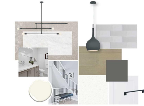
#2, 3550 45 STREET SW MOOD BOARD - FINISHES & SPECIFICATIONS