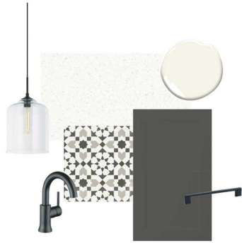
#2, 3550 45 STREET SW MOOD BOARD - POWDER ROOM

*Images are for inspiration purposes only.