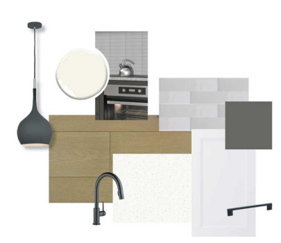
#2, 3550 45 STREET SW MOOD BOARD - KITCHEN