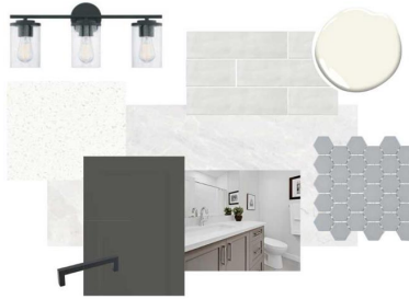
#2, 3550 45 STREET SW MOOD BOARD - PRIMARY ENSUITE

*Images are for inspiration purposes only.