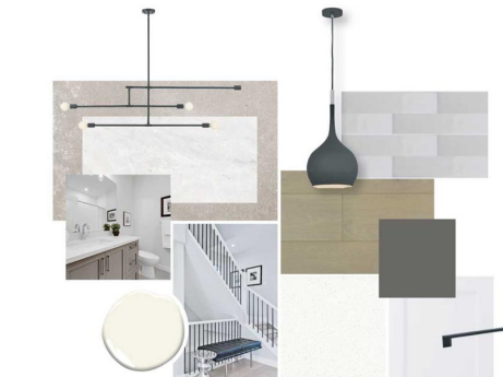
#2, 3550 45 STREET SW MOOD BOARD - FINISHES & SPECIFICATIONS