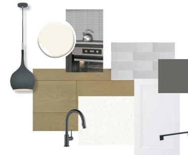
#2B, 3550 45 STREET SW MOOD BOARD - KITCHEN *Images are for inspiration purposes only.