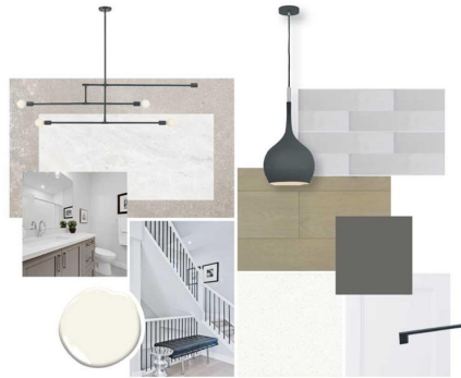
#2B, 3550 45 STREET SW MOOD BOARD - FINISHES & SPECIFICATIONS *Images are for inspiration purposes only.