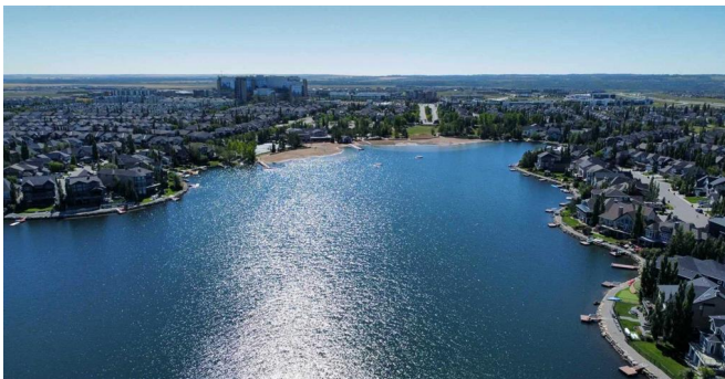
224 Auburn Sound View SE, Calgary, AB

Main Floor - Exterior Area 1201.14 sq ft Excluded Area 515.55 sq ft