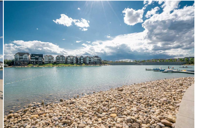
112-12 Mahogany Path SE, Calgary, AB