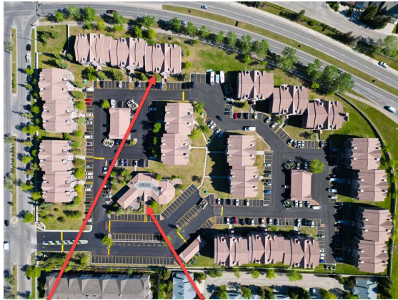
Unit 2012 Entrance to Clubhouse & Property Manager's Office