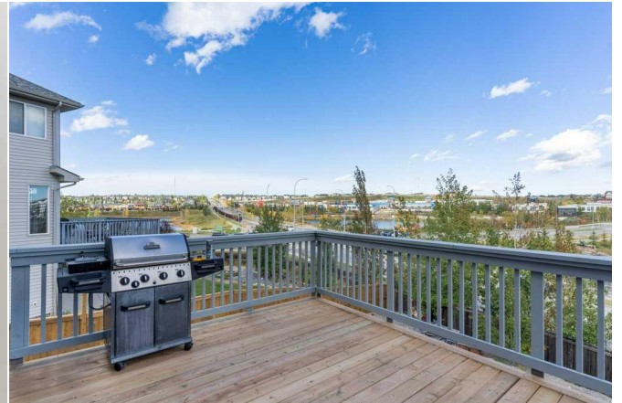
119 St Moritz Terrace SW, Calgary, AB