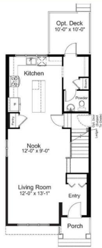
MAIN FLOOR 786 sq. ft.