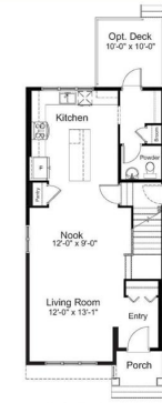
MAIN FLOOR 786 sq. ft.