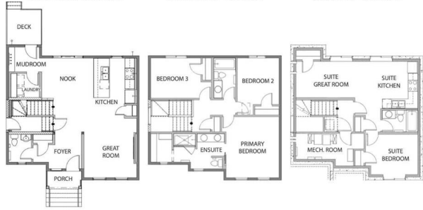
BASEMENT - 556 SQ.FT.